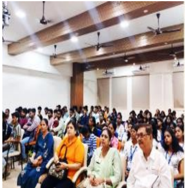
Thalassemia Awareness Session