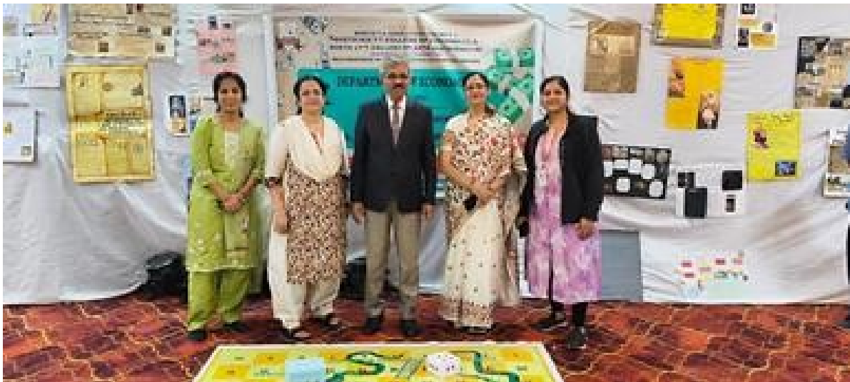
Campus as a mini Economy