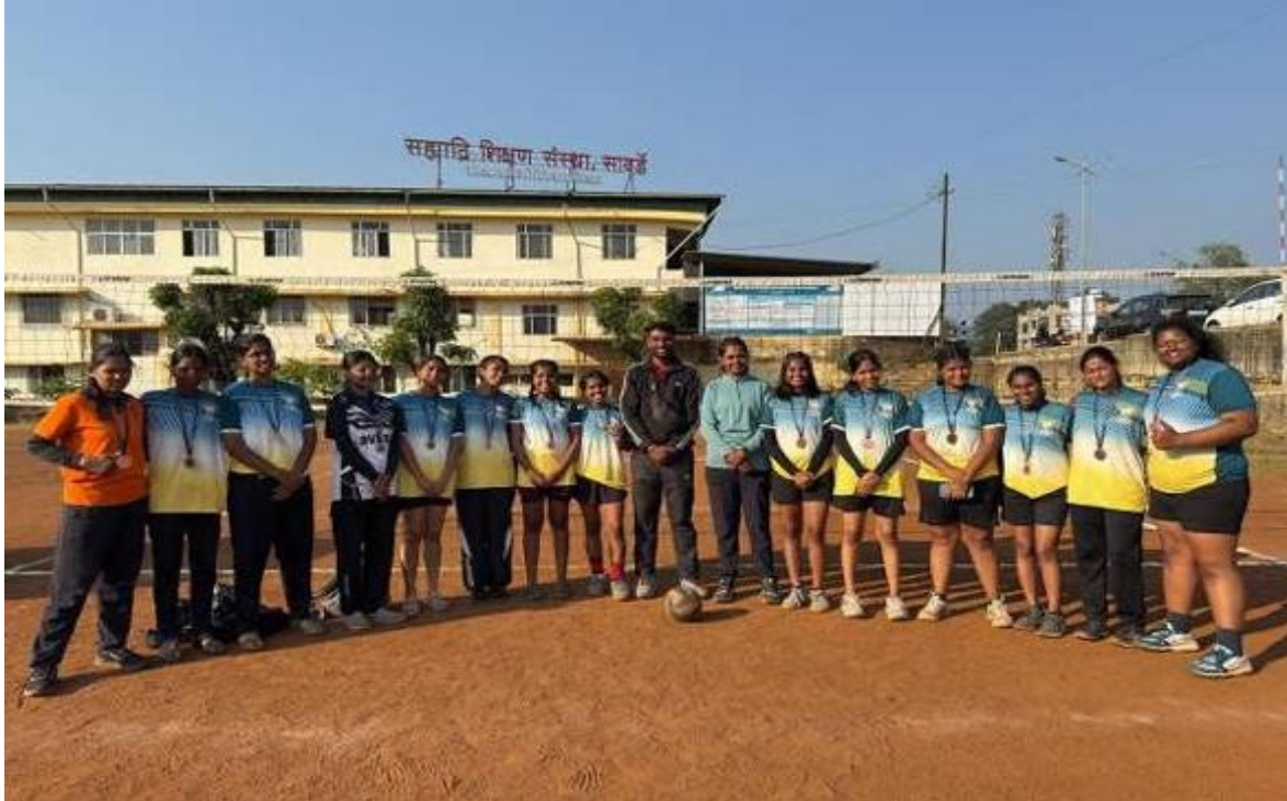
Thane Zone Women's Team secured an impressive 3rd Place in Inter-Zone Volleyball Tournament