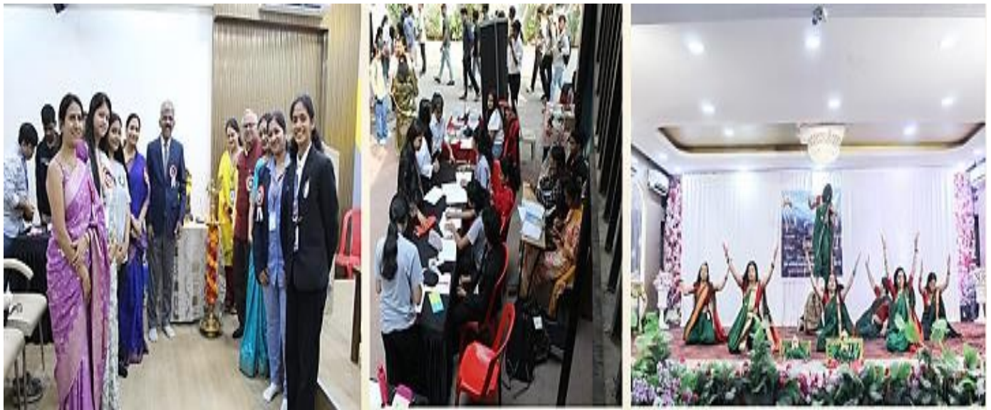
Grand Intercollegiate Competition 'Sonorous: The Voice Within'