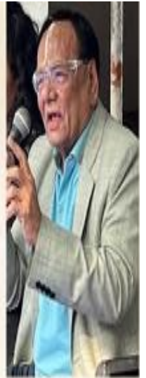
NSS 7 Days Residential Camp