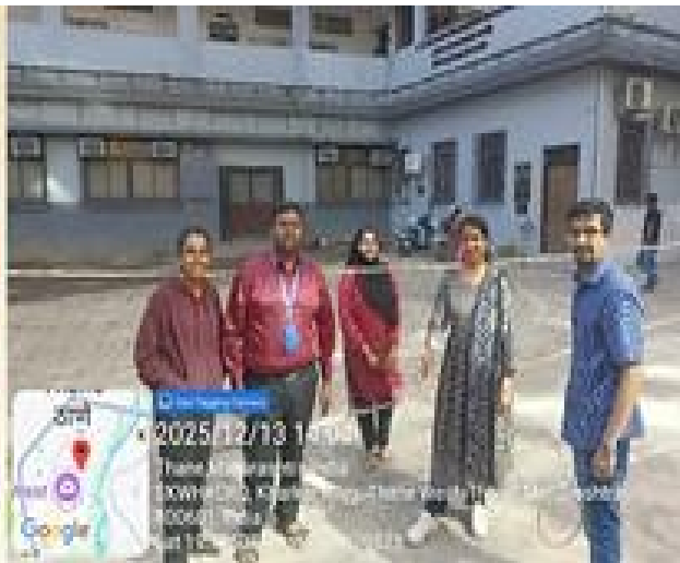
Staff Sports Meet