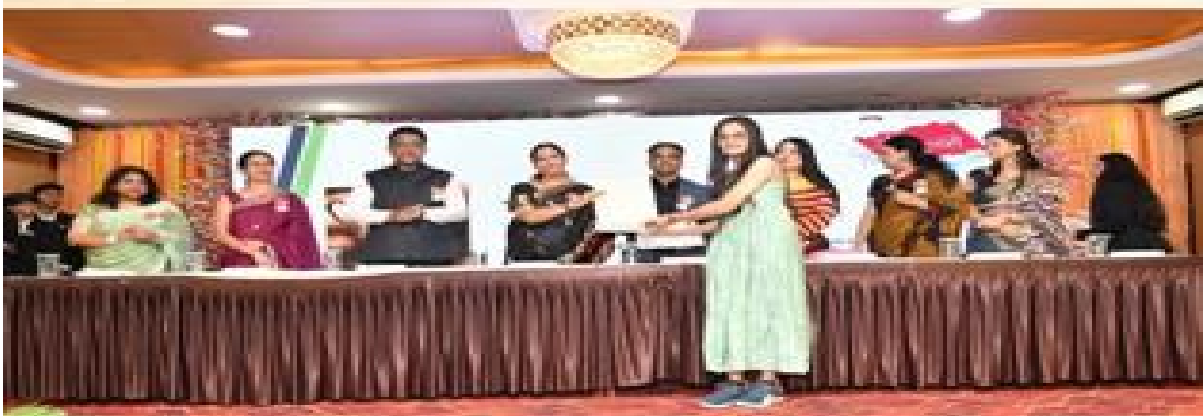
Alumni Meet- Yaariyan 2.0- Celebrating Timeless Bonds