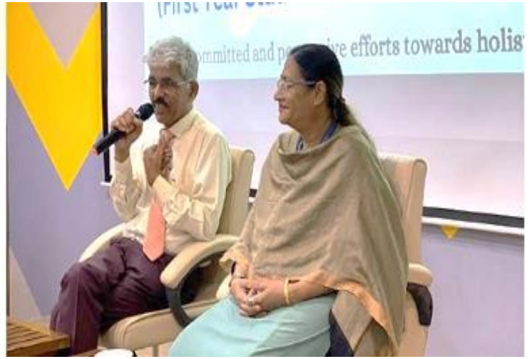
Deeksharambh Orientation Program 25