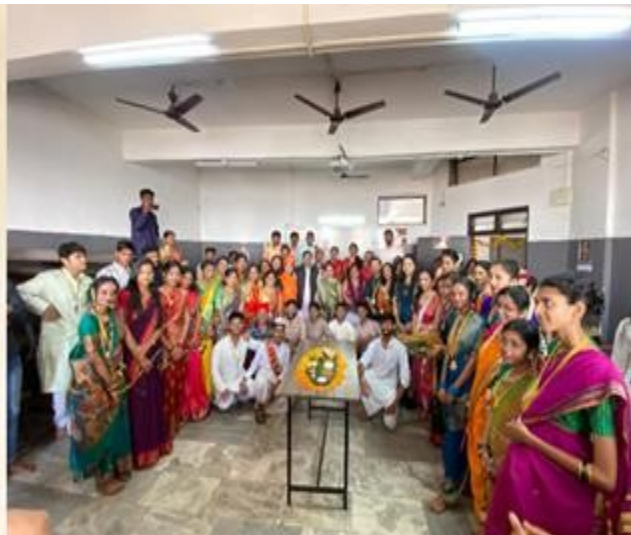
Cultural Week Celebrated with Enthusiasm and Creativity