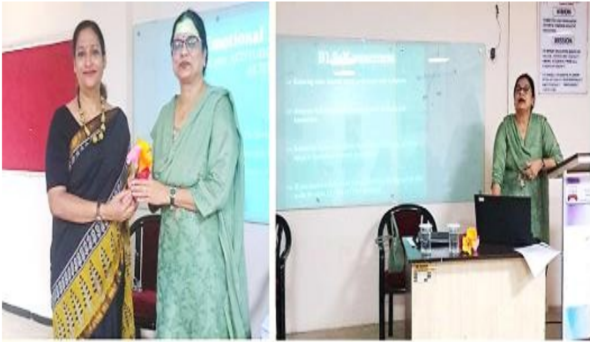
Emotional Fitness: Build Your Inner Strength