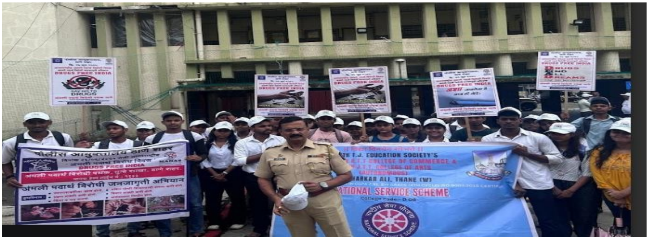
NSS ANTI DRUG 25