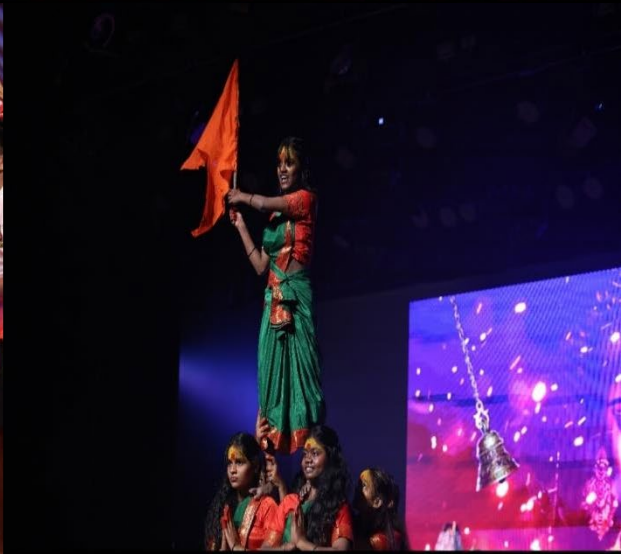
Annual Day Celebration at Gadkari Rangayatan