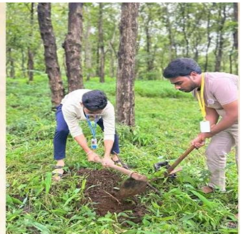
NSS Tree Plantation Drive 25