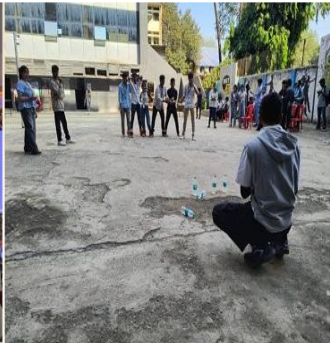
Campus Carnival "Fantasy Fiesta"