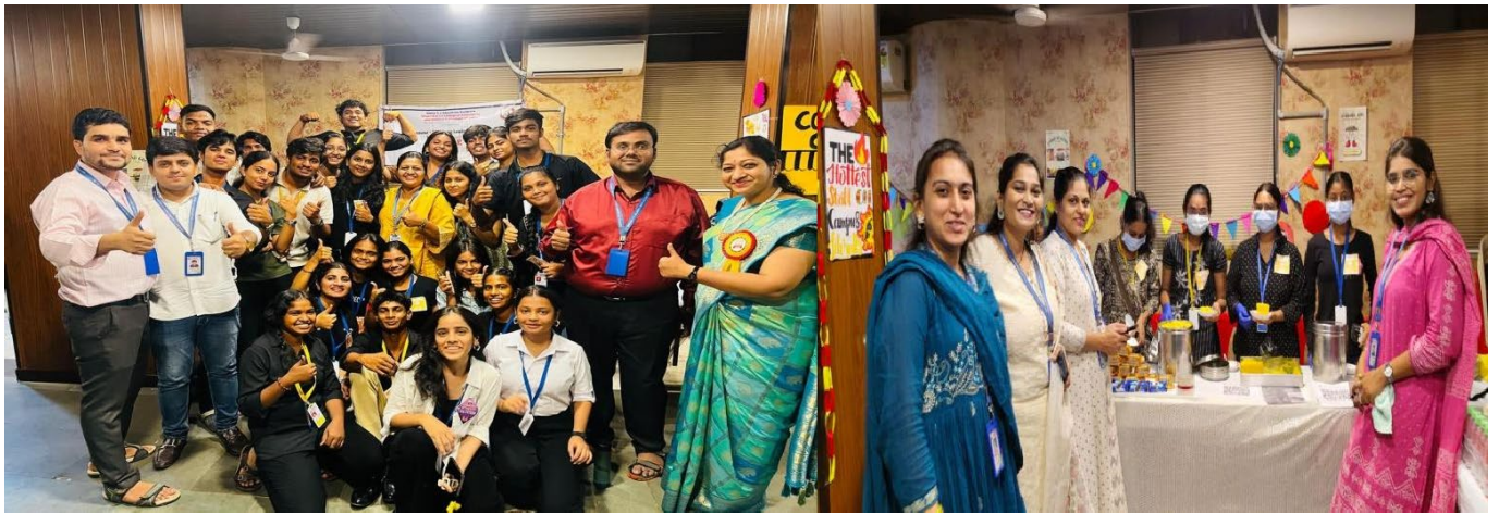
Food Stall by DLLE