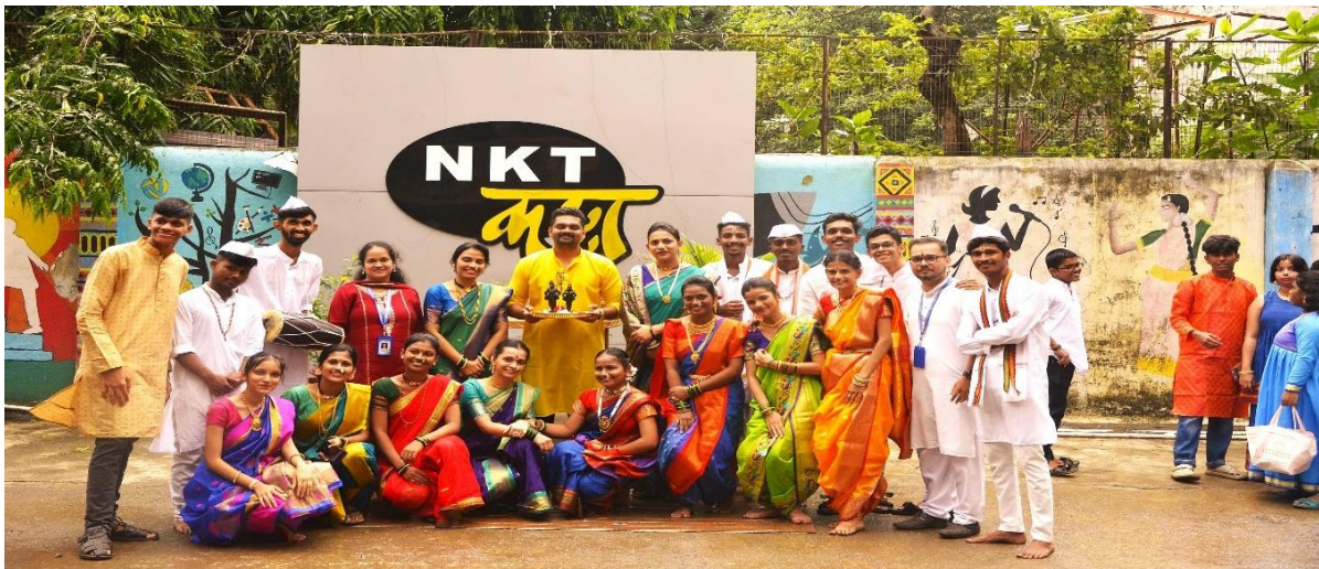
Traditional Ashadhi Ekadashi Celebration 25