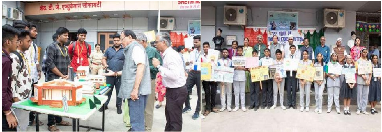
CONSTITUTION DAY CELEBRATION