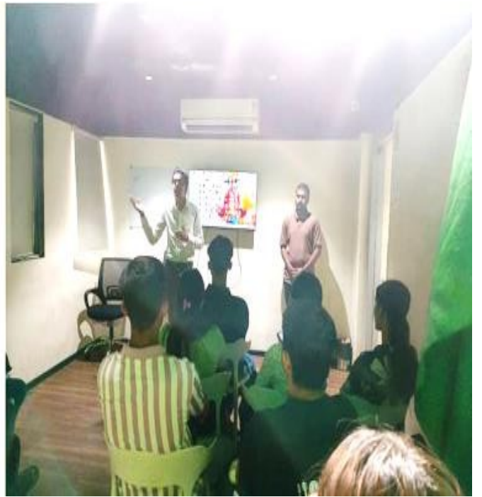
From Lens to Laptop: BAMMC Students Dive