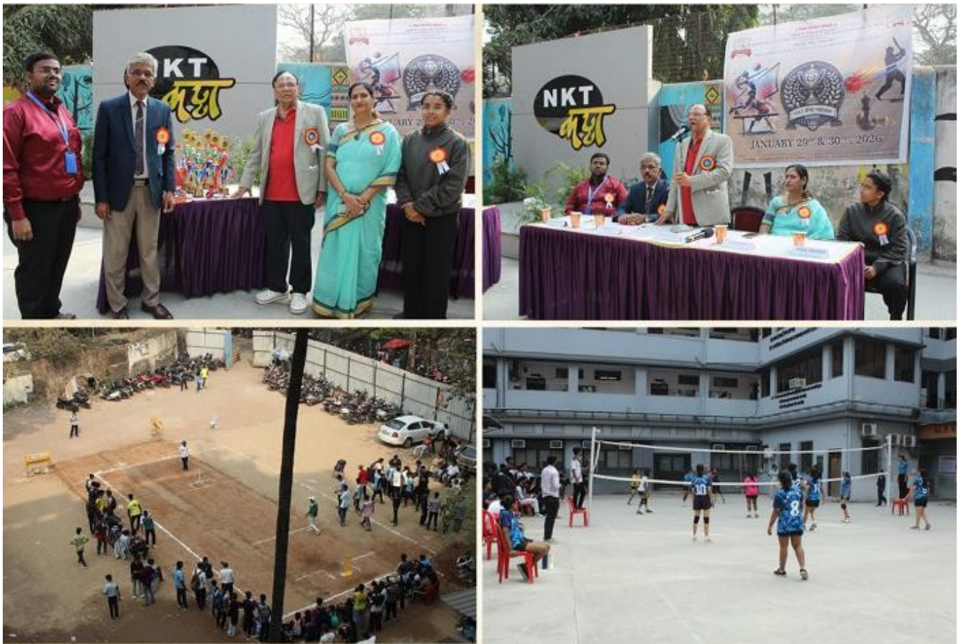
'Krida Mahotsav 2025-26' conducted with great enthusiasm