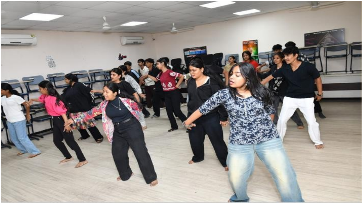
7 Days Dance Workshop