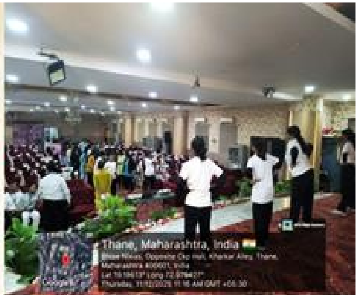
She Leads the World: fitness and Awareness Fest