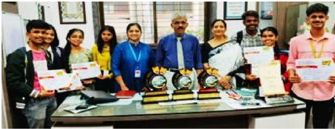
NKT "Hall Of Achievements"