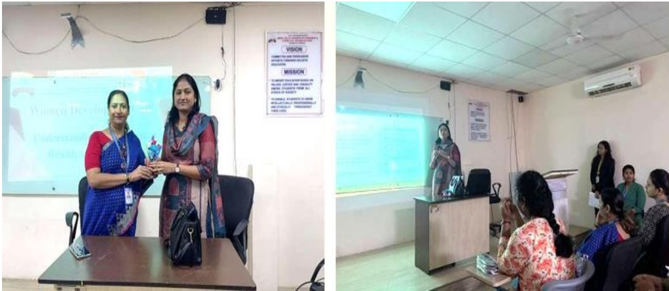
Understanding Menstrual Health & Hygiene